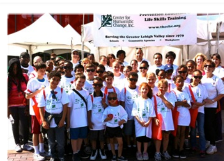
Donegan Elementary School at the 2013 Highmark Walk for a Healthy Community

SAP Certification trainings have been held for 60 school personnel including administrators, teachers, nurses, guidance counselors, psychologists, and support staff. CHC hosted the Lehigh County SAP Consortium - a full-day educational consortium on topics that included Trauma Informed Care, Gang Awareness, and Current Trends in Drugs and Alcohol.