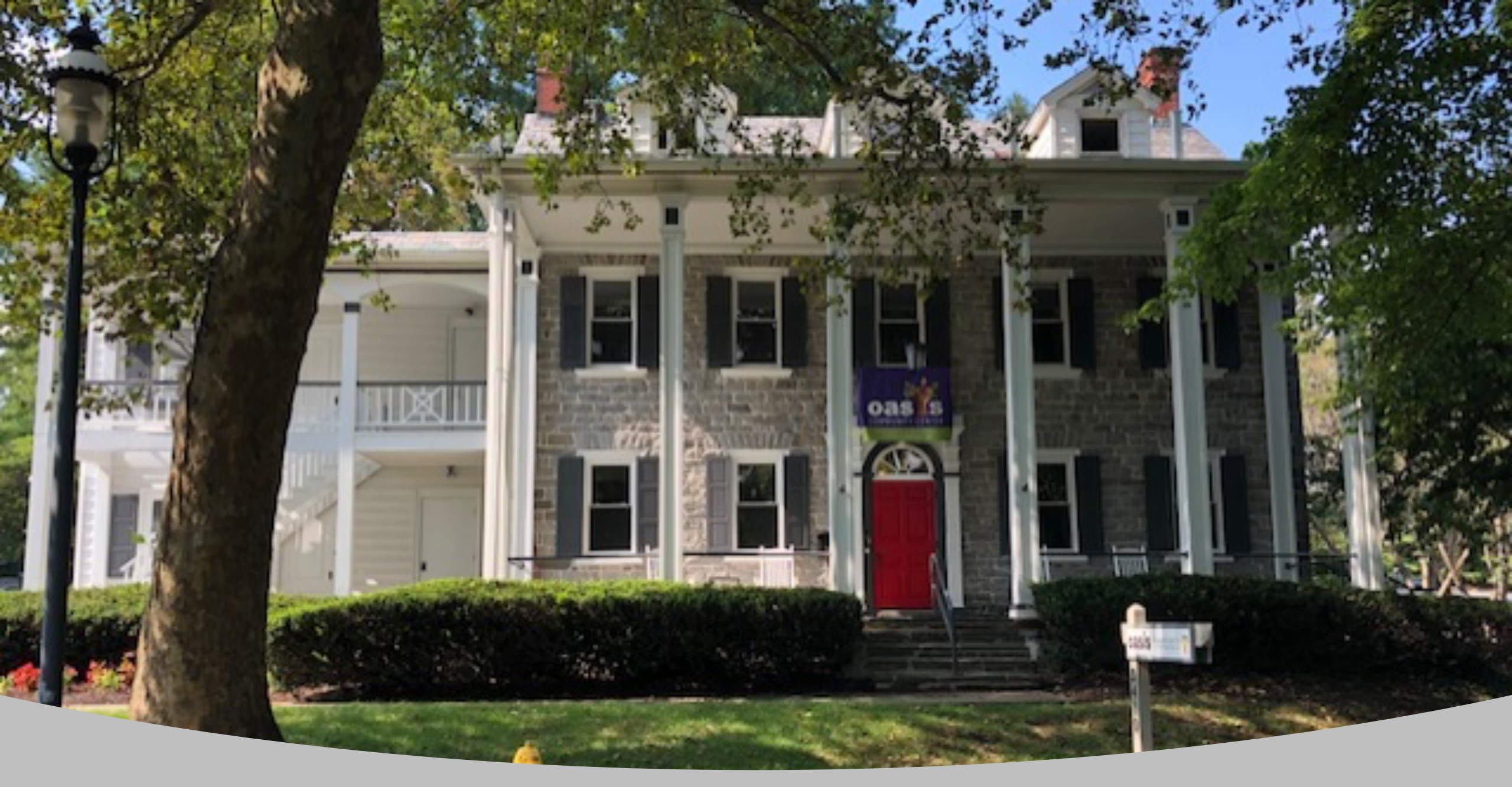
OASIS Community Center