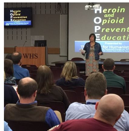
Community HOPE Presentation

HOPE has been delivered to 9,993 community members this year (a 64% increase over the previous year) through school and community presentations. Nearly 2580 teachers, adult community members, and professionals (18 or older) participated in this presentation. All other participants were high school students. To book the program for your group, please call the Center at 610-443-1595. Steps are underway to develop a follow-up program, HOPE II, focusing on intervention, treatment and after-care.