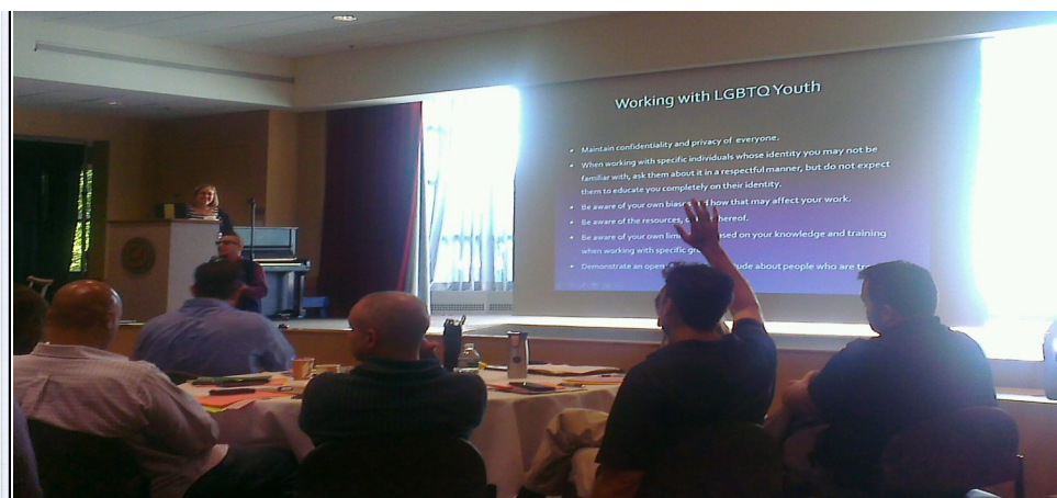
Student Assistance Program Consortium

This year CHC expanded Student Assistance Program (SAP) services from 47 to 52 schools where we provide liaison services, technical assistance, material dissemination, newsletters, team maintenance, and evaluation services. Our Commonwealth Approved Trainer certified 135 new SAP professionals. Fifty-two of these people are from elementary schools, and are now utilizing their new skills to identify and remove barriers to learning and school success K-5. The number of educational opportunities we offered to the SAP community increased from two to three with 150 total attendees. Twenty-four people attended the first ever Lehigh County After-School Elementary SAP Consortium. We are very proud that one of the SAP teams we serve, Whitehall High School, was voted the 2016 “Best SAP Team in Pennsylvania.”