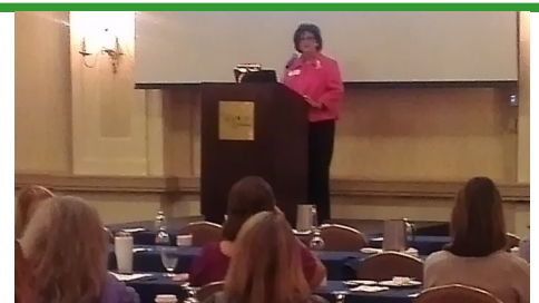
Center for Humanistic Change, Inc 2015-2016 Annual Report